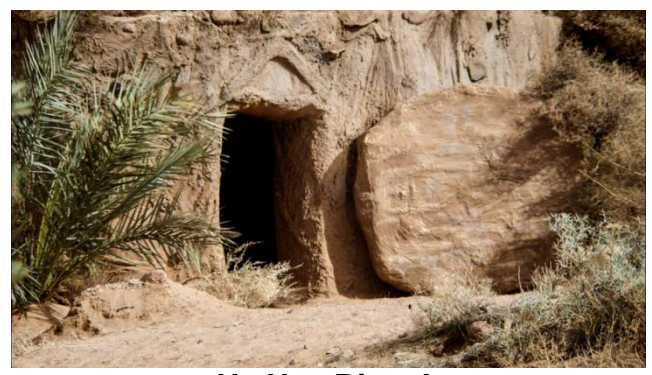
He Has Risen!