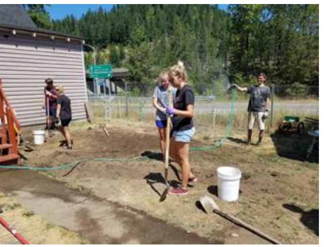
A Servant Adventure crew from Shoshone Mountain Retreat helps replace the "dirty dirt" displaced when a trench was dug from John Boy's house to the garage. Panhandle Health then brought in clean dirt to level the area.