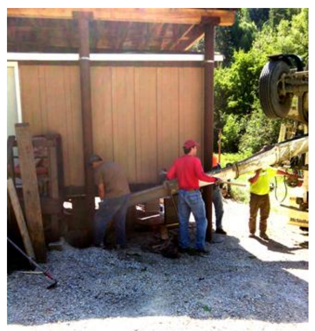
All are involved aligning the chute.