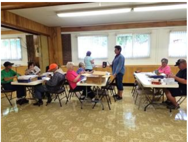
Thanks to everyone who showed up to help with July's newsletter mailing.

We may have a Golf Tournament later this fall.