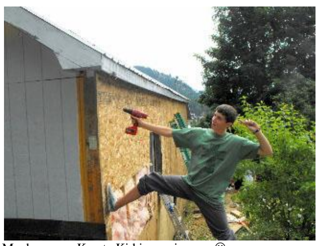
Maybe a new Karate Kid is coming up. ☺