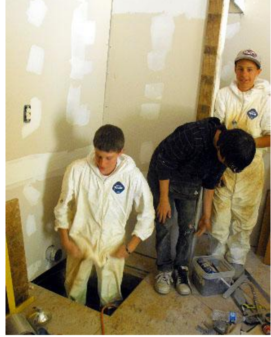
Shoshone Base Camp Servants brush off dust after working under the floor.