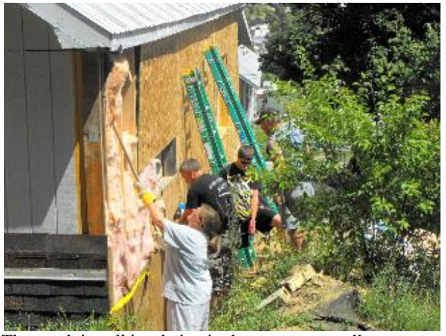
The youth install insulation in the new outer wall.