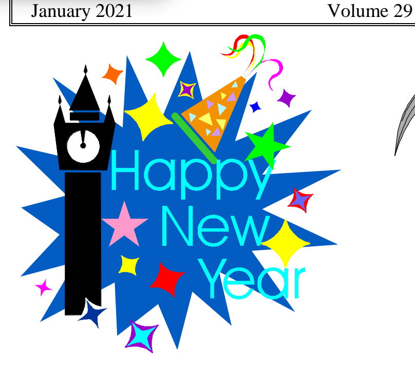
Please stay safe.