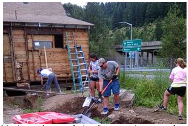
Members of one of the Servant Adventurers from Shoshone Mountain Retreat work on the Osburn house. Here they are covering the electrical conduit laid in a ditch from the house to the garage.