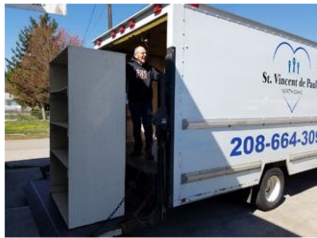
St Vincent de Paul also sent a truck and then came back with a trailer.