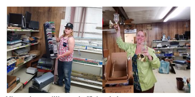
Nice to have willing and efficient helpers.