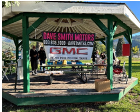
Dave Smith Motors made a generous donation for the Walk.