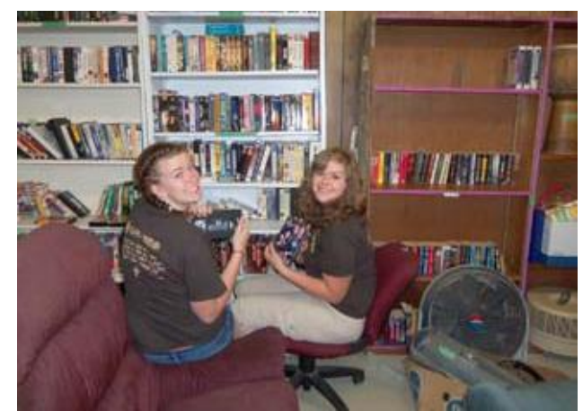
These girls are with the last group of Servant Adventures from Shoshone Mountain Retreat (formerly Shoshone Base Camp) to help this season.

Sept 10—Committee and Board meetings, 6:30 PM, Mountain View Congregational Church Sept 21—16<sup>th</sup> Annual Walk-A-Thon, Registration at 9 AM, Kellogg Middle School