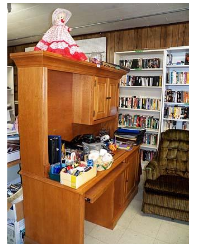
A nice computer desk for sale at $75 loaded with school supplies