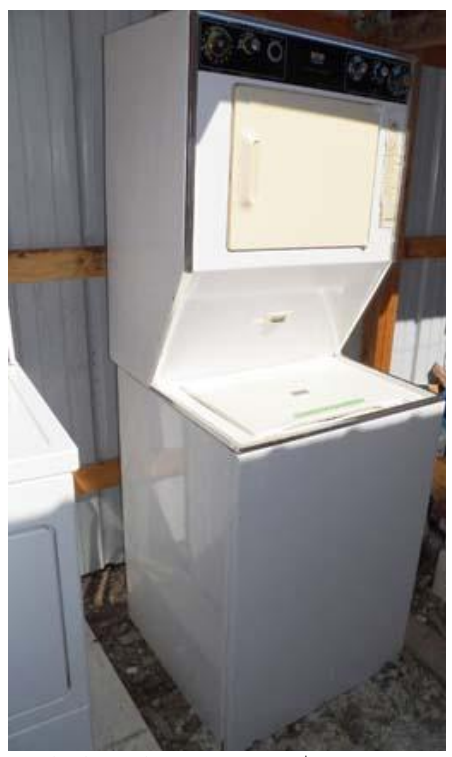
Stacked Washer & Dryer—$100