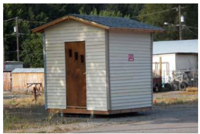
This 8x8 storage shed, built by many hands of visiting youths. is for sale at $960. Projects such as building sheds are great ways for these kids to learn some carpentry skills. Many have never nailed a nail.